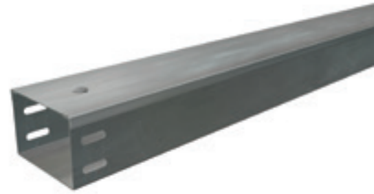
Type 1: inside